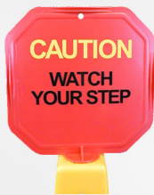
Octagon Warning Sign