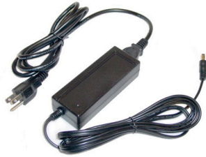
Smart Charger Circuitry: Eliminates the need to unplug the unit after charging