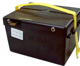
12 Volt Sealed Lead Acid [SLA] High Rate Series