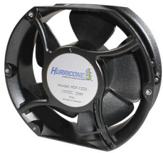
50,000 hour long life brushless DC motor