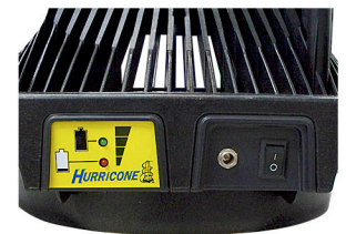
LED & Audible Warnings of Low Battery Voltage